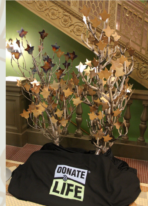
Gift of Life Trees displayed together for Donate Life Month.

Each leaf bears the name of a Montanan who gave the gift of life. Both trees are on public display - one on the first floor of the Capitol, and the other in the Department of Justice's Motor Vehicle Division in Helena.